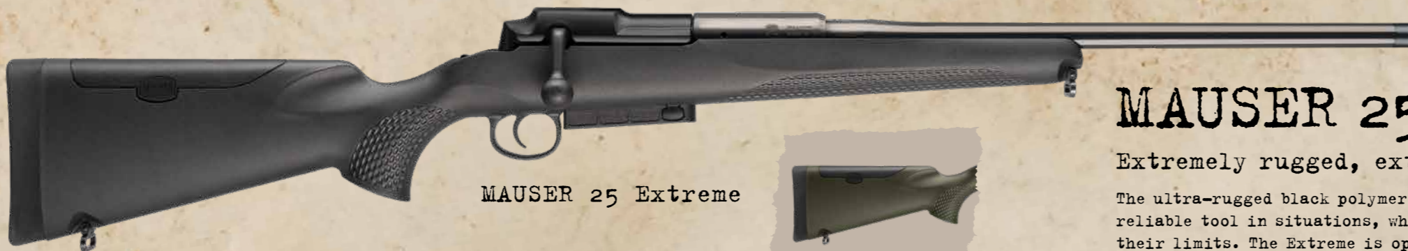
MAUSER 25 Extreme

Overall length: 100 cm | Weight: approx. 3.6 kg