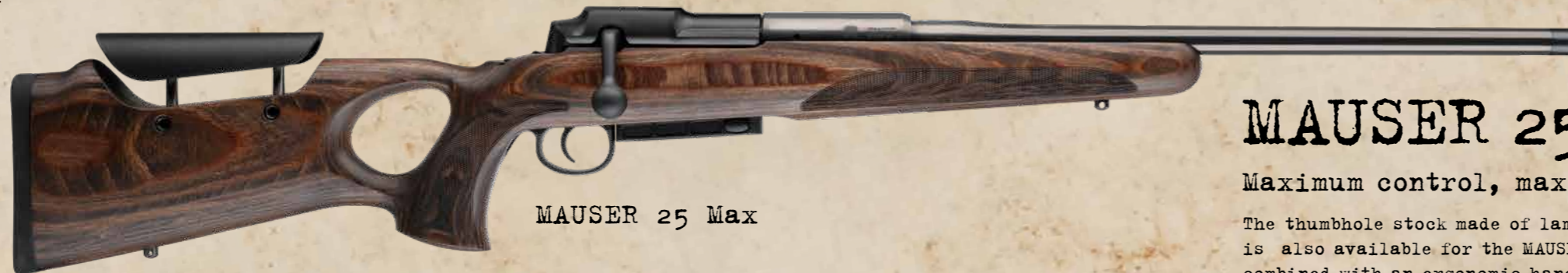
MAUSER 25 Max

T he MAUSER 25 launch portfolio consists of three variants, from the Pure model with its classic sporter walnut stock to the MAUSER 25 Extreme with its ultra rugged polymer stock and the Max version with its ergonomic thumbhole stock made of laminated wood. All three variants have one thing in common - they provide full MAUSER quality, precision and an extremely smooth and fast straight pull action that is unrivaled in this price range!