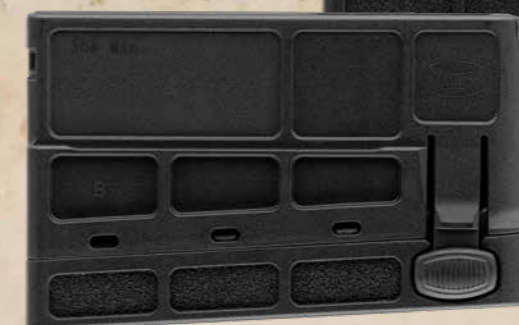
MAUSER 25 3-Round Magazine