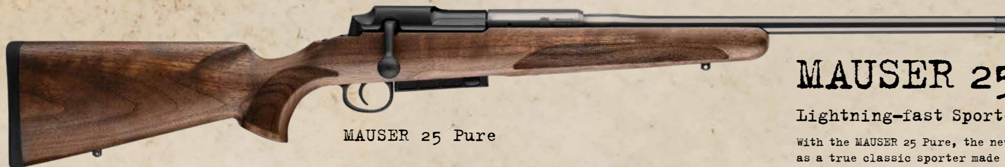
MAUSER 25 Pure

Overall length: 100.5 cm | Weight: approx. 3.2 kg