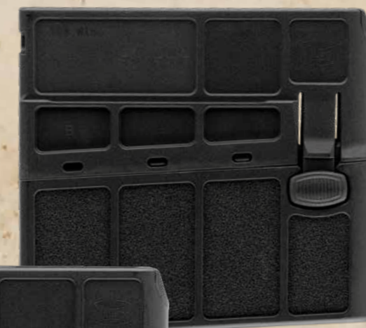
MAUSER 25 5-Round Magazine

Every MAUSER 25 is supplied with a single-row, ultra-robust polymer magazine with a capacity of 3 rounds. Spare magazines and a 5 round-magazine are available immediately at your authorised dealer.